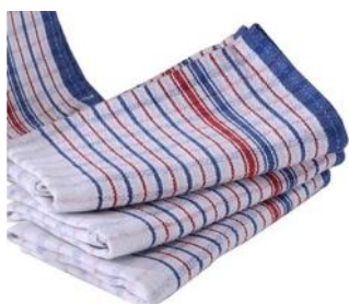
Clean tea towel