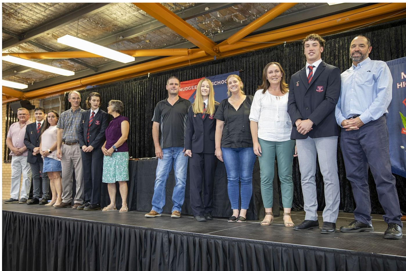
Presentation Night - The incoming captains now clad in blazers with their parents