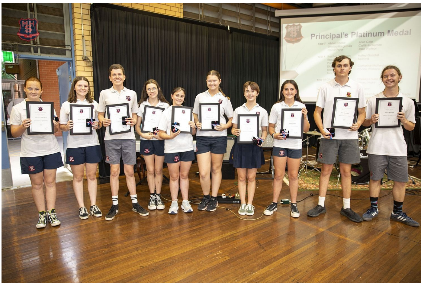
Presentation Night Principal's Platinum Award Winners