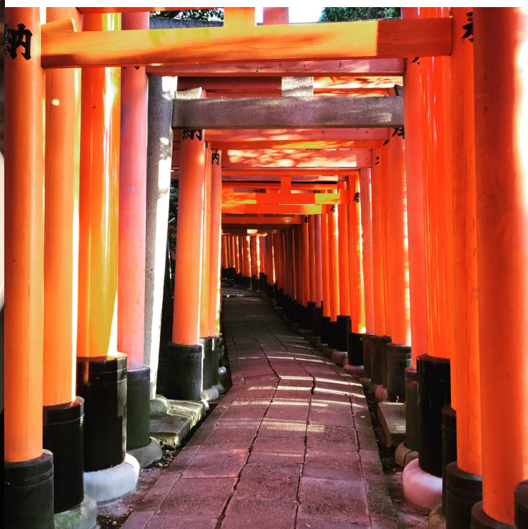
1000 Torii Gates or Fushimi Inari shrine, Kyoto