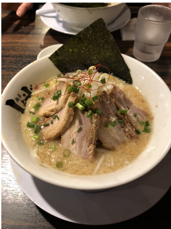
My absolute favourite food - ramen!