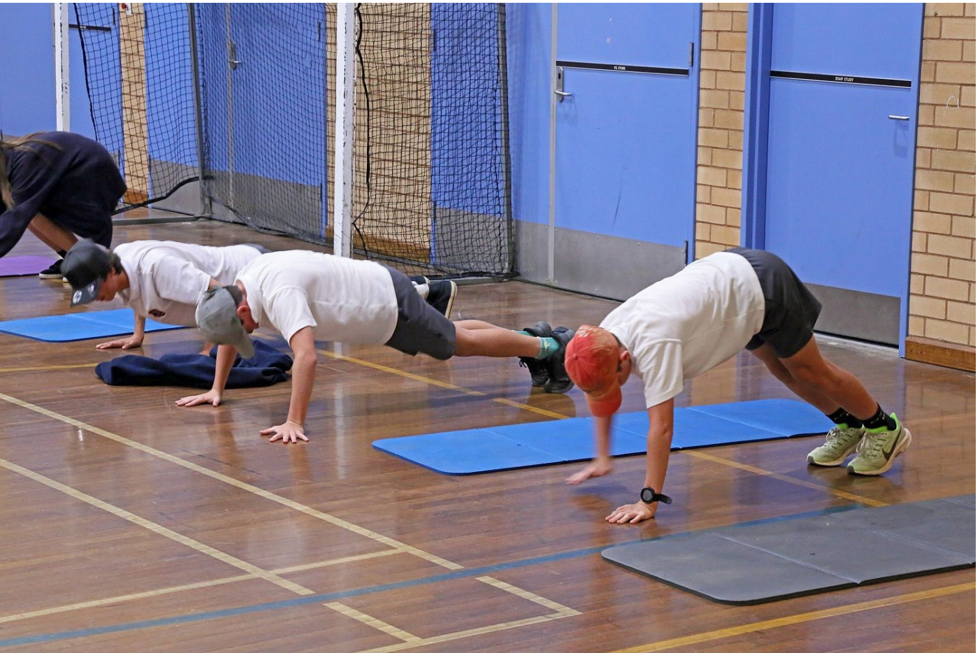
1.5metres apart physical exercise for the few who must be at school