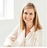
Julie Inman Grant eSafety Commissioner

The safety and wellbeing of Australian children and young people is paramount, so I hope this information is helpful to you.