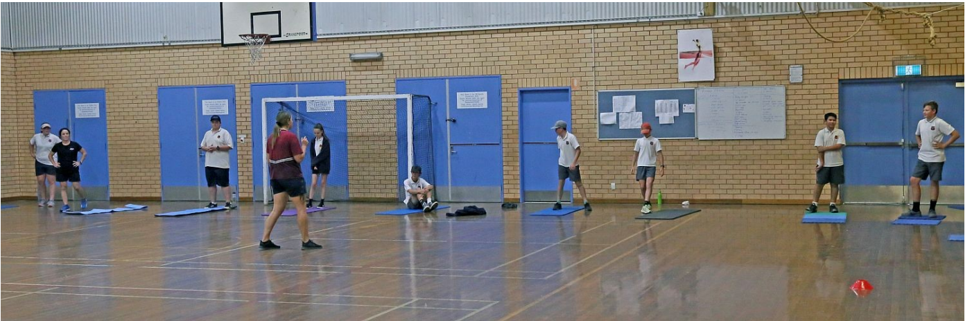
Ms Shearman leads 1.5metres apart physical exercise for the few who must be at school