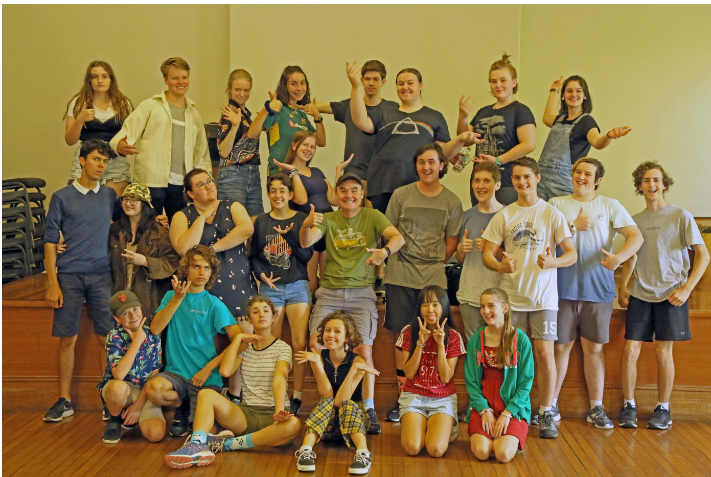
OnSTAGE excursion participants 2020