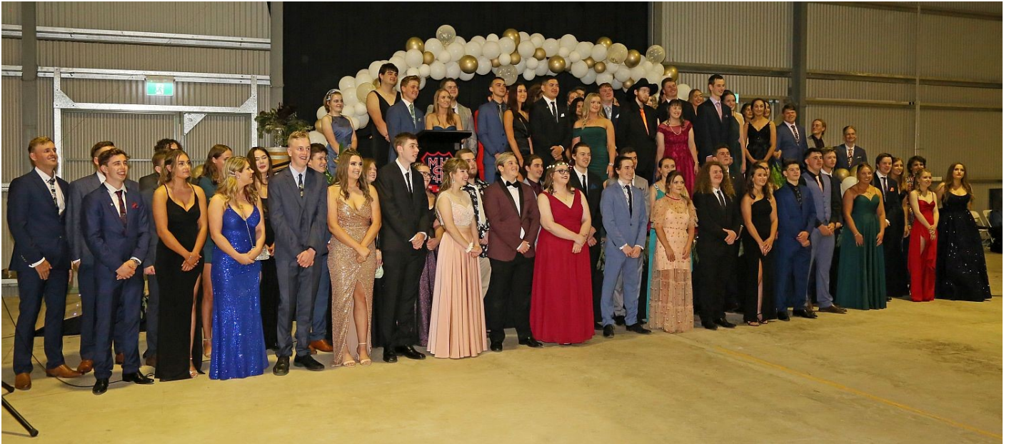
Year 12 Graduation Formal