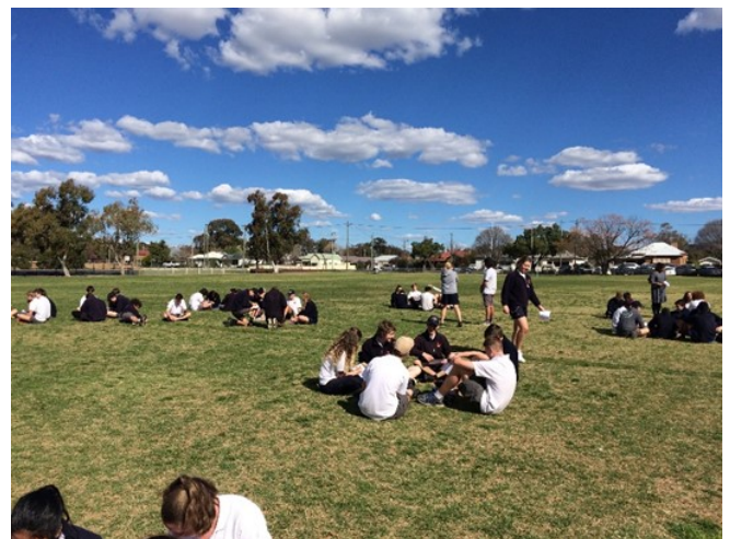
Students actively learning through culture.