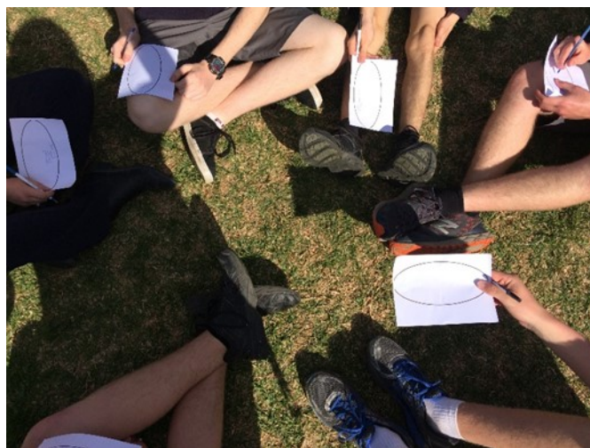
Students writing on their message sticks.