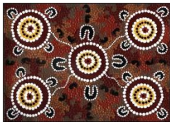
Bawamarra (Relate news, Communicate)

For English Studies students, Term 4 focuses on the mandatory module We are Australian: English in Citizenship, Community and Cultural Identity . Parents and students are reminded that this course qualifies students for an HSC, but not an ATAR. Students requiring university entry must not do this course.