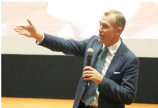
The Minister speaks