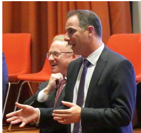
The Shadow Minister speaks

Finally, a gentle reminder to Year 11 students and their parents/carers. The study skills workshop to be held next Monday evening is an exceptionally worthwhile one and the first of three to assist you in getting the most from your HSC years.