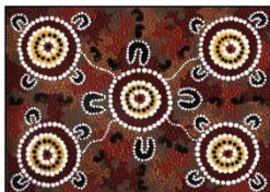
Bawamarra (Relate news, Communicate)