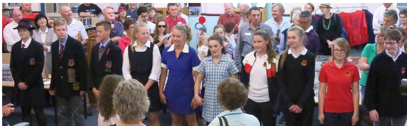
Fashion parade of MHS uniforms