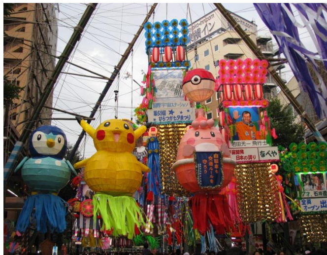
Tanabata decorations in Hiratsuka