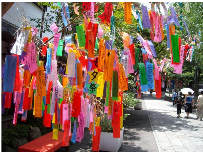
Paper wishes on bamboo branches

As Tanabata approaches, decorated bamboo branches can be seen all around the neighbourhood, signalling that summer has finally arrived and that summer vacation is just around the corner.