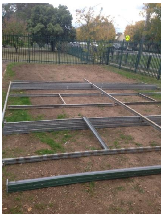
Figure 1: Start of COLA for aquaponics system

Stay tuned for more exciting developments as our system comes to fruition over the coming months.