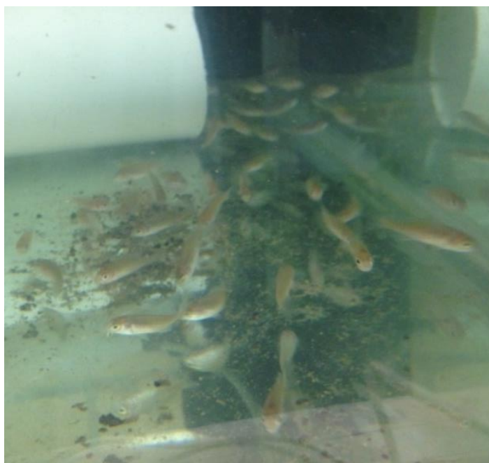
Our first 50 silver perch