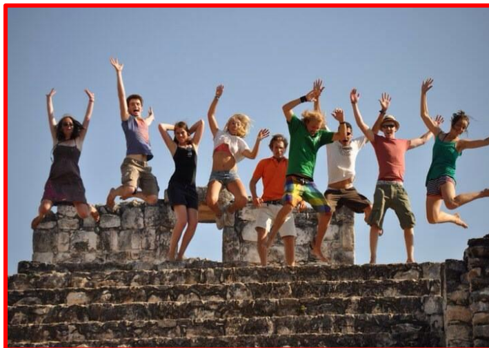
Mexico & the Yucatan Peninsula