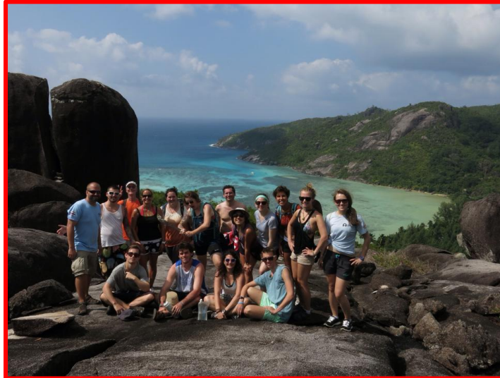
GVI Seychelles Mahe & Curieuse

Below are some random examples of some of the many places you can be involved in: