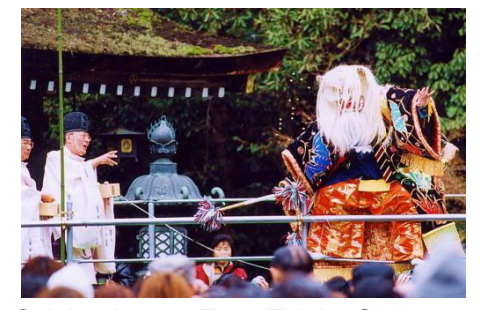
Celebrations at Taga Taisha Shrine

Year 7 students this year will be exposed to many typical Japanese cultural practices. In particular, they will study a major festival every month. Classes have already learned about Setsubun which takes place on February 3 or 4, one day before the start of spring according to the Japanese lunar calendar. For many centuries, the people of Japan have been performing rituals with the purpose of chasing away evil spirits at the start of spring. In modern days, common practice is to scatter roasted soya beans around one's house and at temples and shrines across the country. When throwing the beans, you are supposed to shout "Oni wa soto! Fuku wa uchi!", which means "Devils out! Happiness in!" In honour of this ceremony students made their own 'oni' masks in class and learned about other rituals.