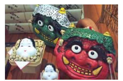
"Oni" masks and soya beans packages sold for the festival

Students have also celebrated Hinamatsuri which was held in Japan on the 3<sup>rd</sup> of March. It is a day where families recognise their daughters and wish for their future happiness and success. Hinamatsuri means 'Doll's Festival' and traditionally, families will display 15 dolls in ancient court dress on a seven tier doll stand which has been covered in a red cloth. The most recognisable symbols of this festival are the Emperor and Empress dolls which were the head of the imperial household. Parents hope that their daughters will be as noble as these court dolls. The dolls are often passed down from mothers to daughters. Relatives give gifts of furniture, trees and household items to girls to add to their displays. They are displayed for a few days only, before they are carefully packed away again for another year. There is an old superstition that suggested that if the dolls were not packed away in a timely fashion then it would become difficult to marry her off!!!