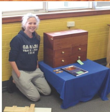
Zoe da Roza: Collectors Chest from Kalantas, Australian Red Cedar and Mahogany