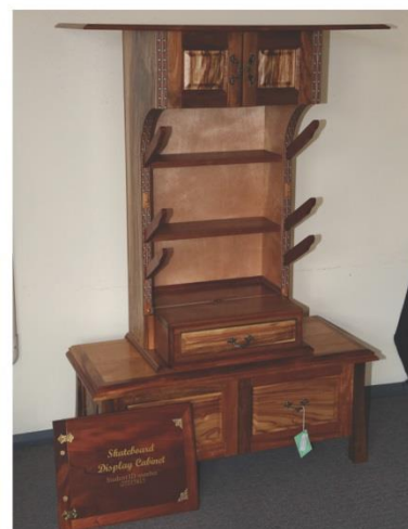
Luke Dunstall: Skate Board Rack/Cabinet from Walnut, Blackwood and Camphor Laurel