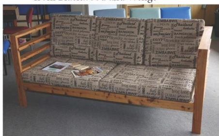
Jacob Mart: 2 Seater Sofa from Cypress Pine