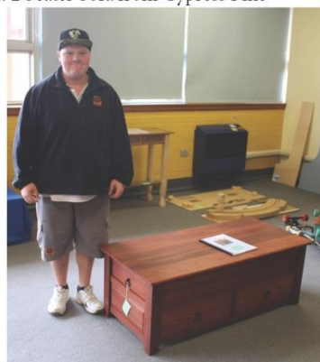
Josh Thurlow: Coffee Table from Jarrah