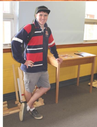
Jesse Lewis: Hall table from Tasmanian Oak