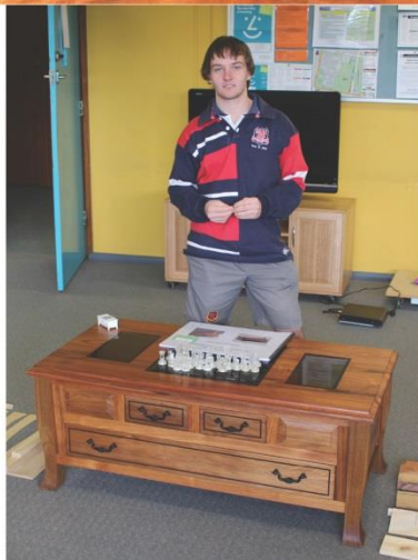
Rhyan McNair: Chess Board Coffee Table from Blackwood and Wenge