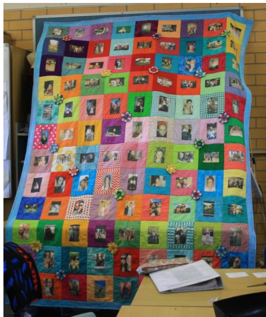
Kate Fekkes Furnishing Picture Quilt