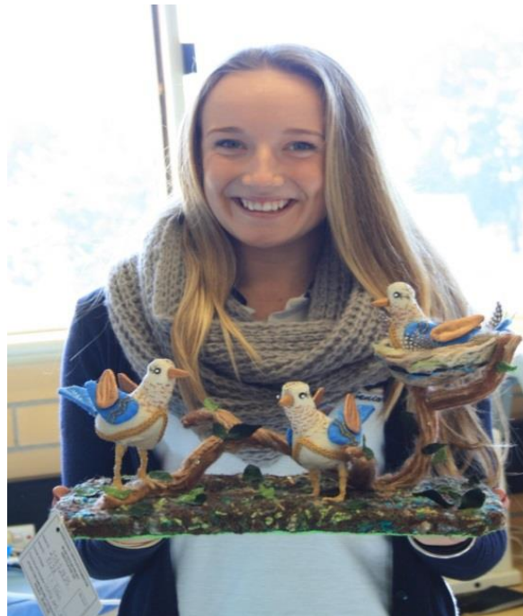
Grace Parker Textile: Art Bird Sculpture