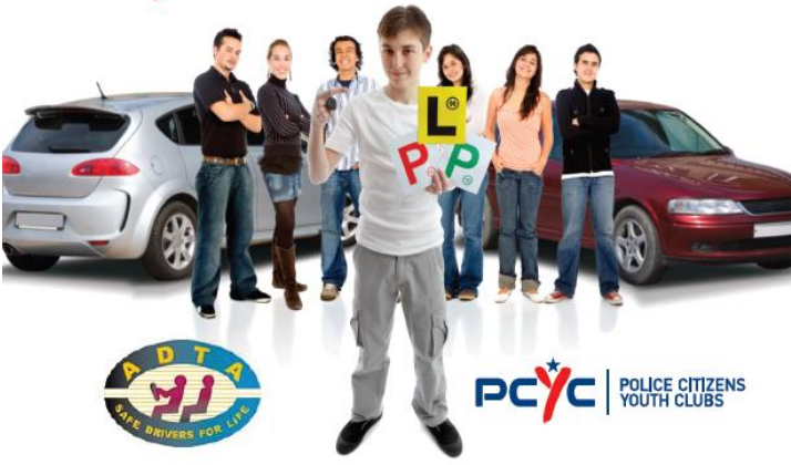
PCYC are an accredited provider of the Safer Drivers Course. Guiding young people in the right direction since 1937