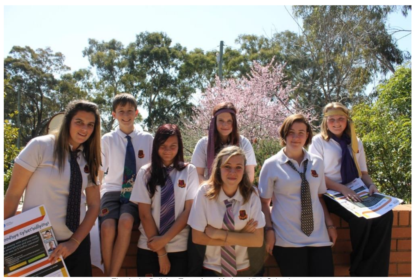
The Anti – Bullying Team from Mudgee High School