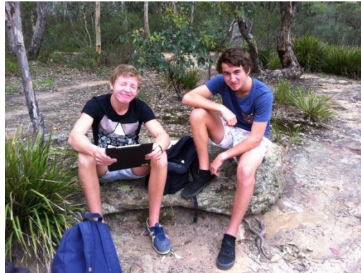
Enjoying field-sketching and note taking