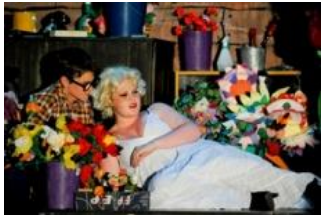
PHOTOS FROM LITTLE SHOP OF HORRORS